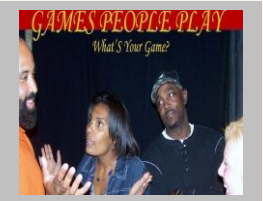
GAMES PEOPLE PLAY